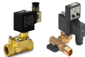
WATER & DRAIN SOLENOID VALVES

The Merlin 500S isolation panel prevents water flowing to the restrooms where drug samples are being taken.