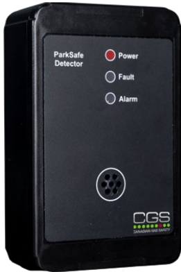
Dimensions (H x W x D) 4.92" x 3.74" x 1.38"